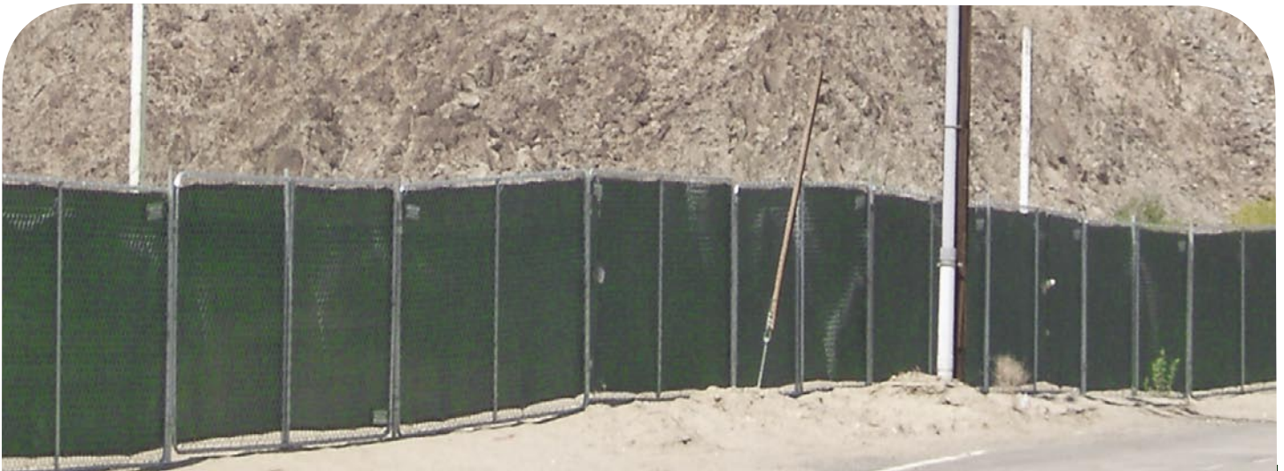
construction screen on temporary panels - meeting city ordinances to block vision, dust and debris

Midwest Cover Inc. is a manufacturer, providing custom fabricated, premium materials to fit virtually every fencing application. From a variety of windscreens, privacy screens, construction site screens to custom netting - we deliver top quality materials to your exact specifications.